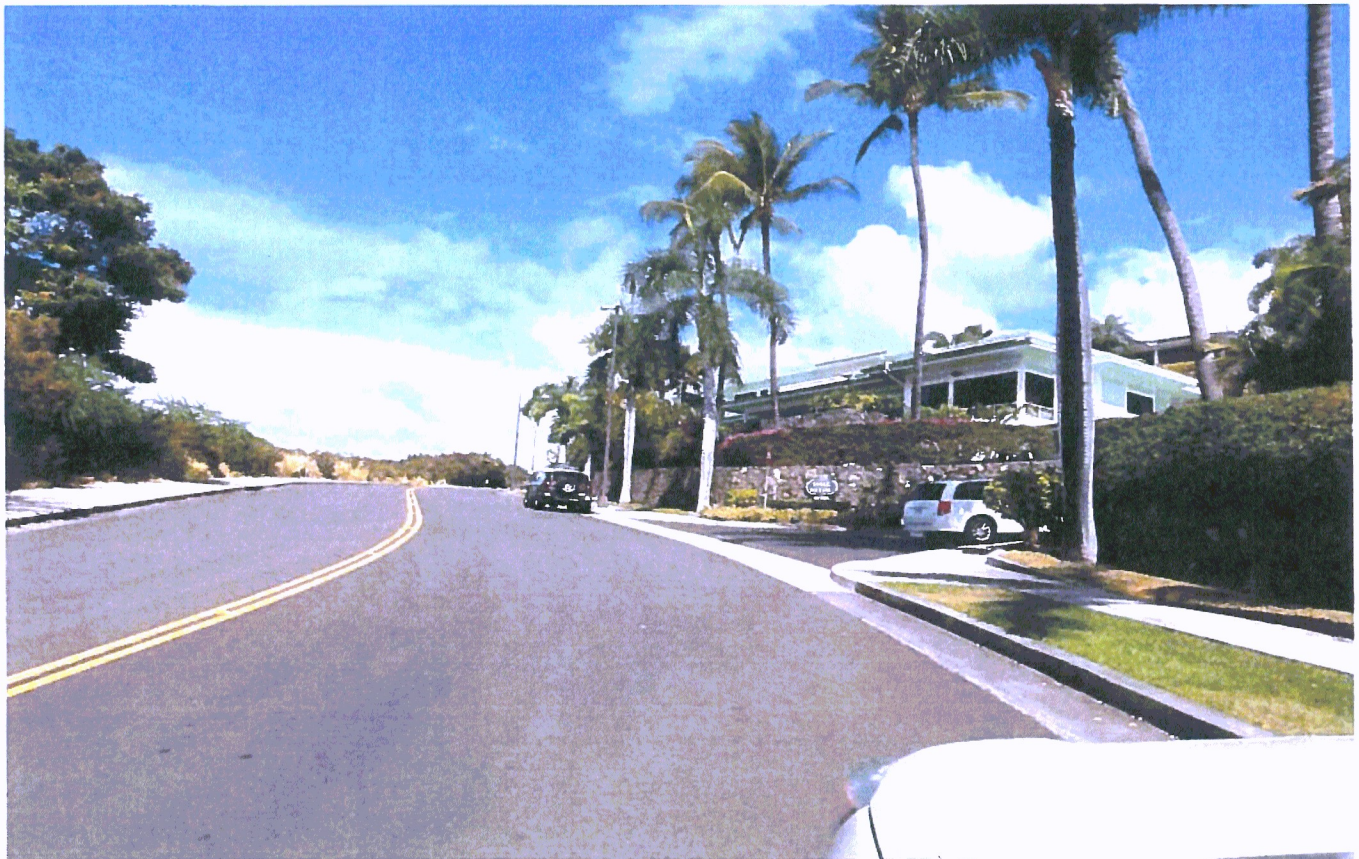
View of Kaluna Street toward Hale Kehau