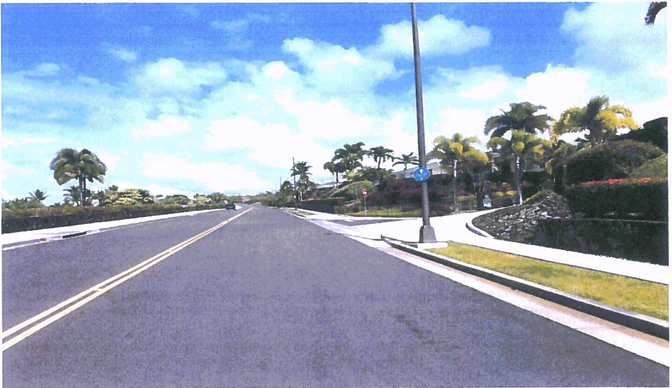
View of Kaluna Street toward Bayview Estates