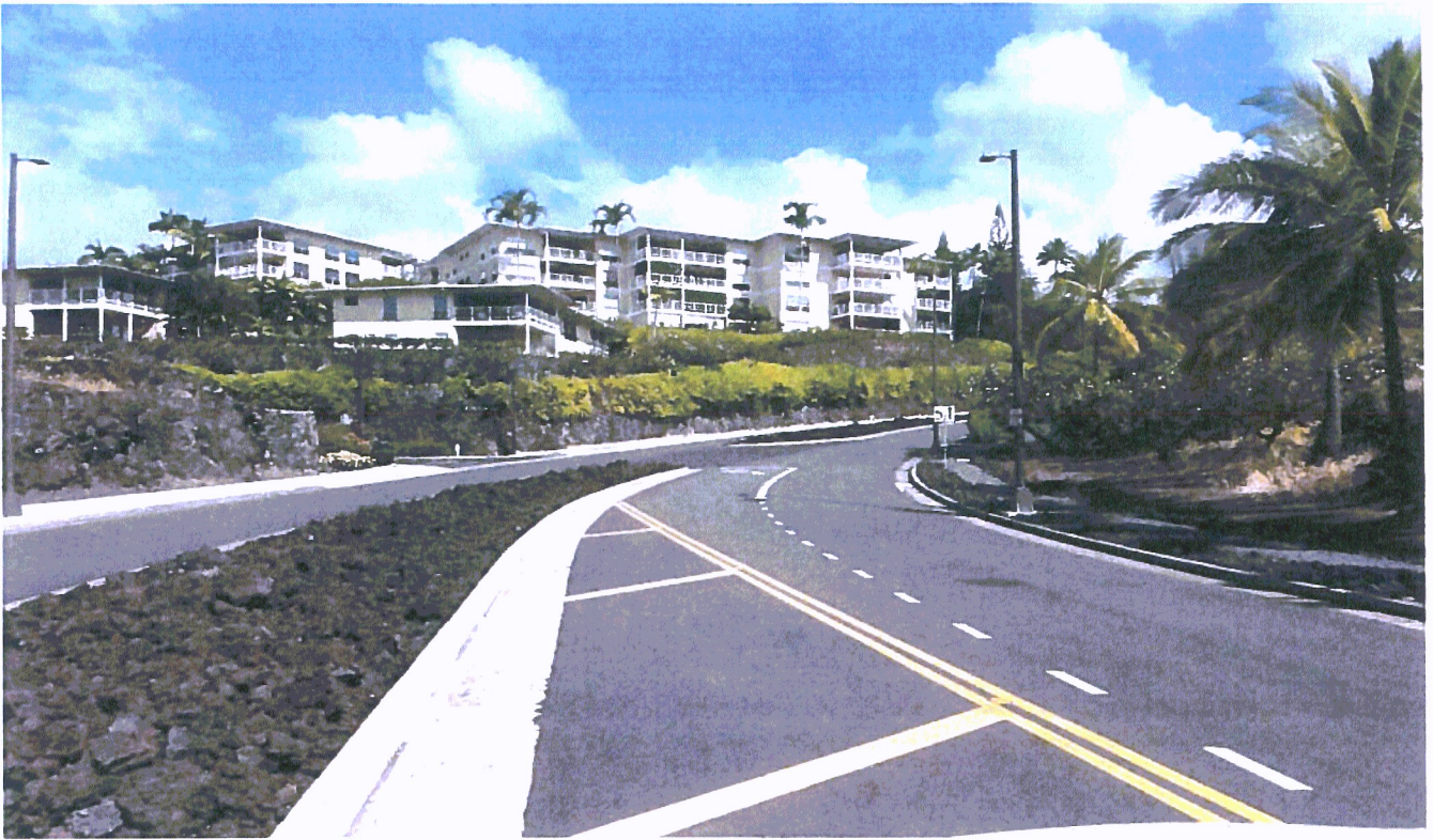
View of Kaluna Street from Alii Drive