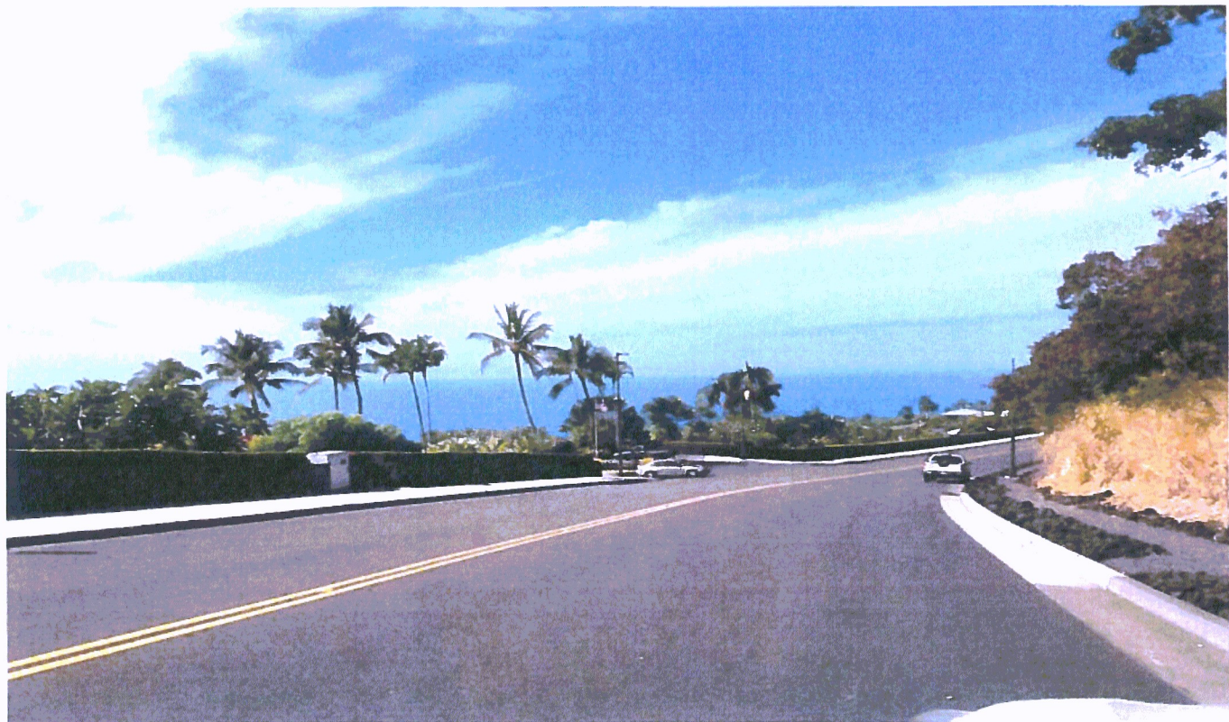
View of Kealii Street toward Keauhou Estates