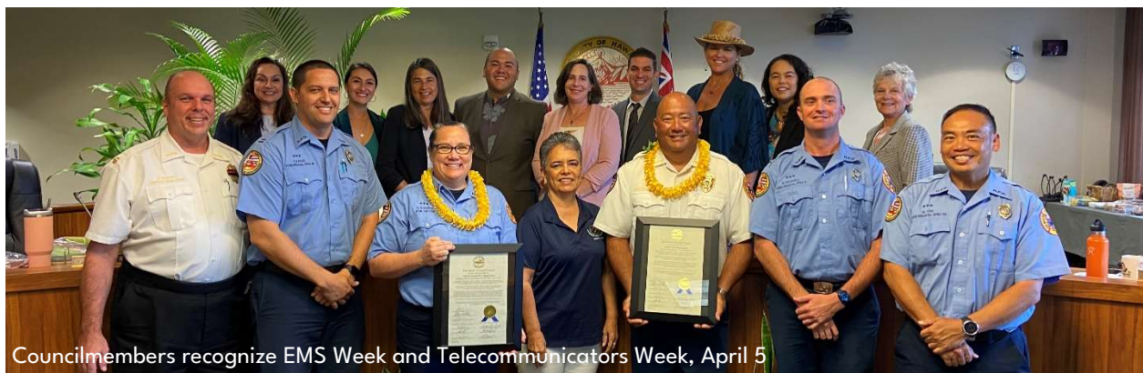
Councilmembers recognize EMS Week and Telecommunicators Week, April 5