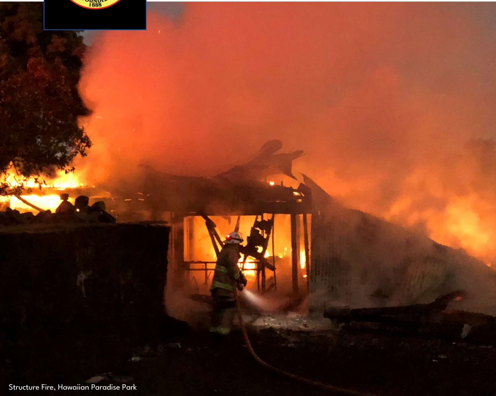
Structure Fire, Hawaiian Paradise Park