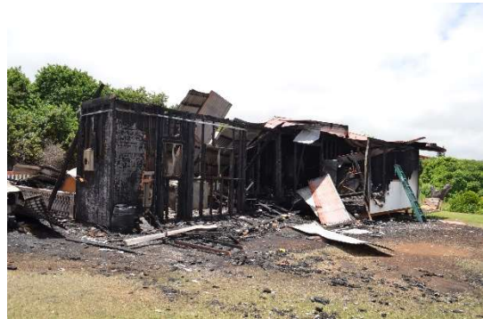
District 11 Fire Investigation