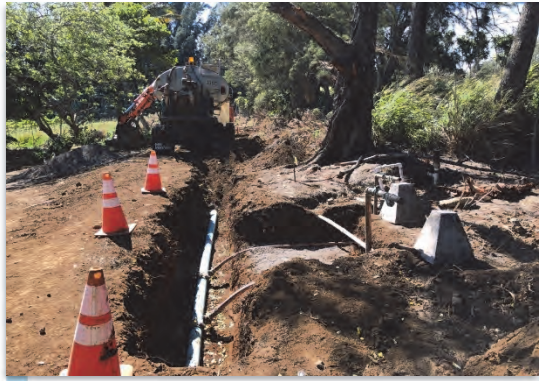
New 4-inch irrigation water line pipe and lateral installation in the Lower Hamakua Ditch Watershed

24. BRIEF DESCRIPTION OF PROJECT AND RELEVANCE TO THIS CONTRACT (Include scope, size, and cost)