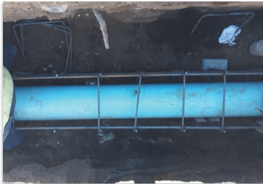
Installation of new 8-inch sewer line within the intersection of Punchbowl Street and Queen Street

Fee - $3,434,000 Construction Cost - $19,393,000