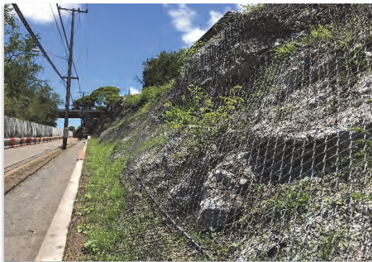
Wire mesh slope stabilization system

Fee - $1,367,000 Construction Cost - $9,200,000