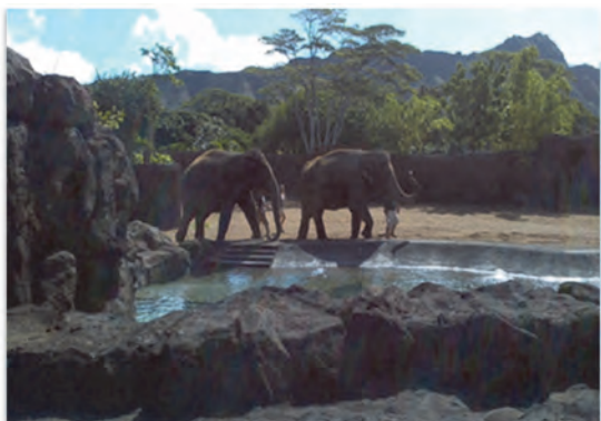
New Elephant Exhibit at the Honolulu Zoo

Fee - $625,000 Construction Cost - $6,435,000