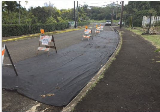
BMPs implemented at project site