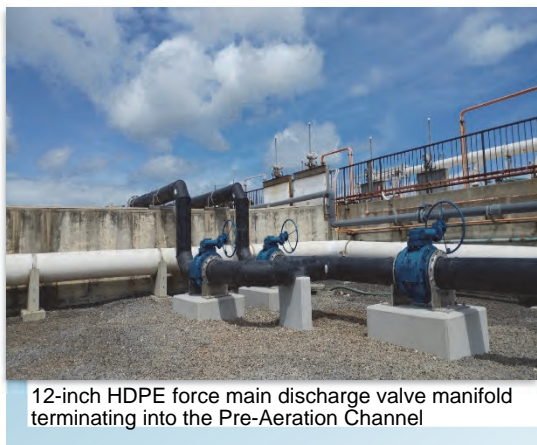
12-inch HDPE force main discharge valve manifold terminating into the Pre-Aeration Channel

Fee - $500,000 Construction Cost - $3,441,000