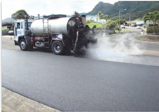
Resurfacing Keolu Drive in Kailua, O'ahu