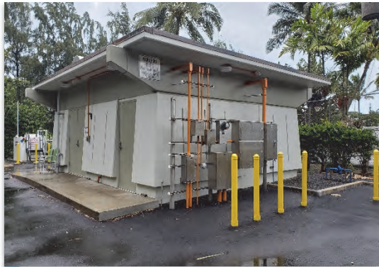
Refurbished pump station building with new fuel tank

Fee - $1,000,000 Construction Cost - $6,685,000