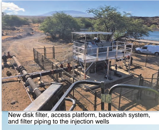
New disk filter, access platform, backwash system, and filter piping to the injection wells

Design Fee - $521,000 Construction Cost - $1,550,000