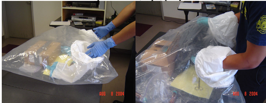
Using the Isobag to sample