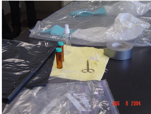
Prepare all sampling equipment