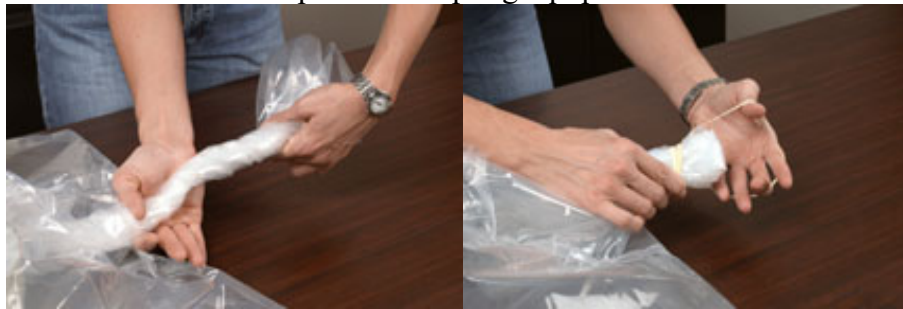
Example of twist, tape, ponytail