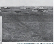
Campbell Residence at Honolulu