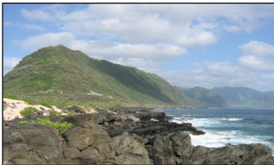
Ka'ena Point, Oahu.