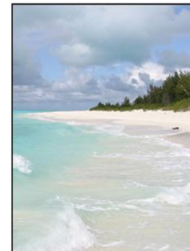
Sandy atoll shoreline.

To ensure the reliability of reported laboratory results, we participate in performance evaluations for the Safe Drinking Water Act (SDWA), National Pollutant Discharge Elimination System (NPDES), and other water pollution programs. Performance evaluation samples are obtained from Environmental Protection Agency (EPA) certified providers.