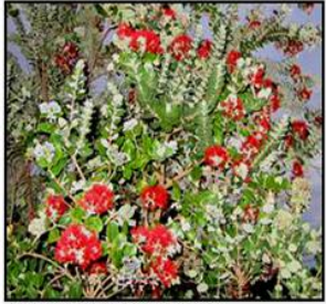
O' hia lehua in full bloom.

AECOS, Inc. is a Hawaii owned and operated environmental consulting firm providing quality analytical laboratory and field services for governmental, industrial, commercial, and private clients throughout the Pacific Basin.