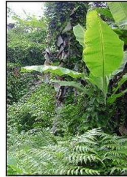
Kawa Stream overgrowth, Oahu.

Field studies are designed using established techniques for onsite sampling, organism collection, identification of flora and fauna, and measurement of environmental parameters.