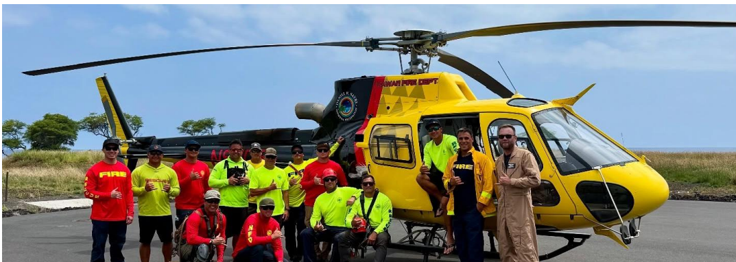
Training (Station 7 & 14)