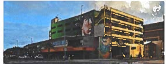
Kamehameha Schools Office & Retail Leasing