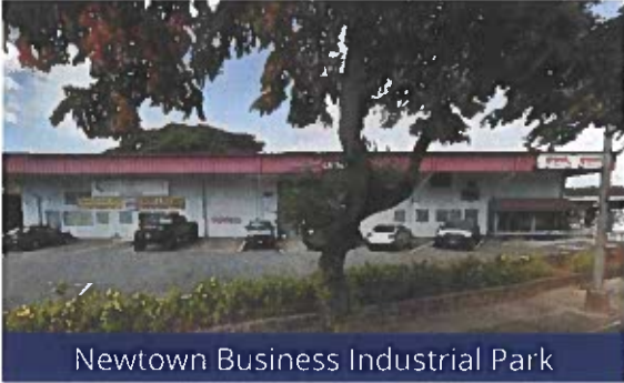
Newtown Business Industrial Park