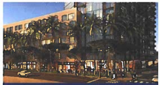
Ward Village Retail Leasing