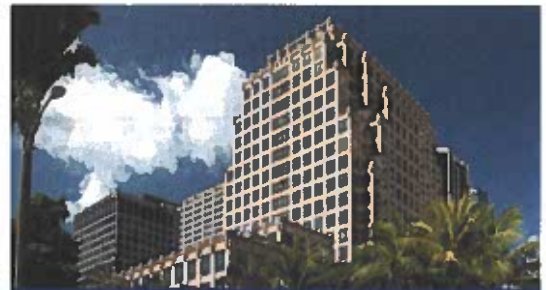
Alii Place Office Leasing

Recognized for its comprehensive market reports and its thorough real estate analysis, Colliers Consulting and Research Division has become a vital component of nearly every Colliers client engagement and has set the industry standard for market analysis and advisory services.