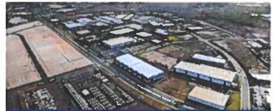
Kapolei Trade Center Industrial Sales & Leasing

Our Brokerage Division, comprised of professionals in commercial real estate investment sales as well as office, retail and industrial leasing, has directed on average more than 800 transactions in Hawaii per year. These specialists are noted experts with extensive knowledge of deal structures, landlord financial thresholds, investor criteria, and market trends to best advise our clientele on the correct methods, negotiation strategies and ideal timing to consummate a deal. Whether for a landlord, tenant, seller, owner-user or investor, Colliers has the professionals, resources and expertise to achieve and surpass our clients' objectives.