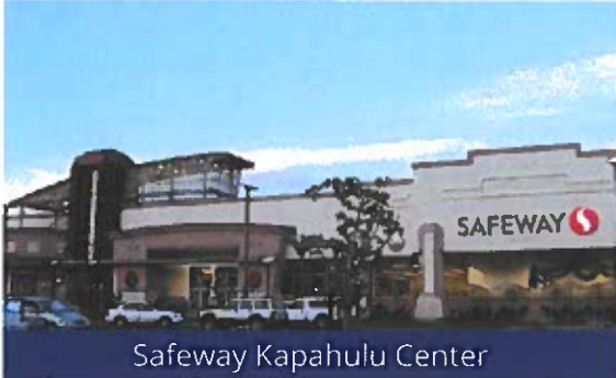
Safeway Kapahulu Center