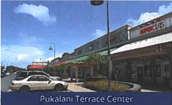
Pukalani Terrace Center