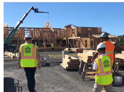
Construction progressed quickly in 2023 at the Kaloko Heights Affordable Housing Project in Kailua-Kona.

The pipeline includes all affordable housing units in various stages of development - from proposal to nearly complete - on Hawai'i Island. By continuing to fill the pipeline with viable projects, the OHCD is ensuring units will continue to be placed into the