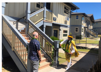
Waikoloa Family Affordable 110 units + manager unit Targeting households earning up to 60% of AMI