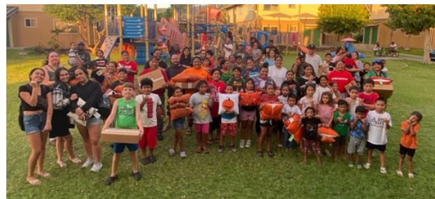
Families who reside at Na Kahua Hale O Ulu Wini received donated laptops from Vibrant Hawai'i.

To ensure the laptops went to families that needed a computer most, property manager Mark Development, Inc., reviewed its tenant list and identified which families at the Kailua-Kona affordable housing complex had children attending school and did not have a computer in the home.