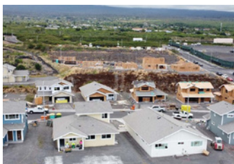
Ikaika Ohana completed 24 single-family homes at the Department of Hawaiian Homelands La'i 'Opua Village 4 Akau in Kona.