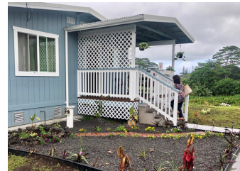
HOPE Services Hawai'i Inc. completed 12 modular studio units for veterans and kupauna at its Sacred Heart Housing Project in Pahoa.