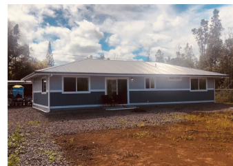
The HICDC completed 10 self-help homes in Ainaloa for families earning up to 80% of AMI.