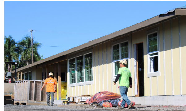
The community center will feature a lounge, coffee bar, fitness room, and other amenities.