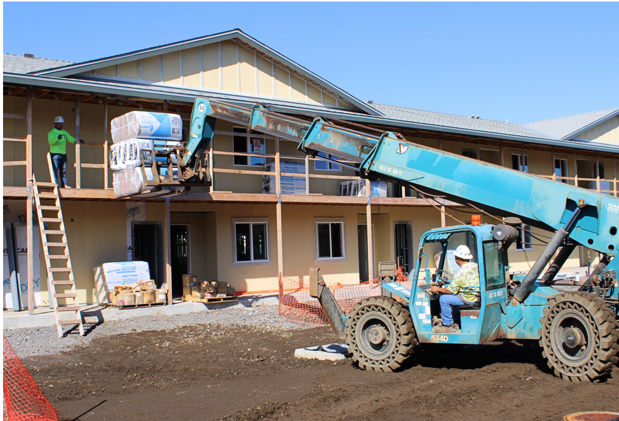
Workers use a telehandler to lift insulation to be installed in units at Hale Nā Koa 'O Hanakahi.

Contractor Stan's Contracting, Inc., anticipates the project will be complete in mid-April.