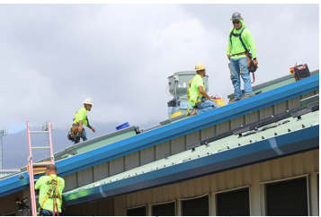
A photovoltaic roof-mounted system with batteries is being installed at the West Hawai'i Emergency Shelter.

The West Hawai'i Emergency Shelter will soon become more energy efficient thanks to a solar-plus-battery system upgrade.