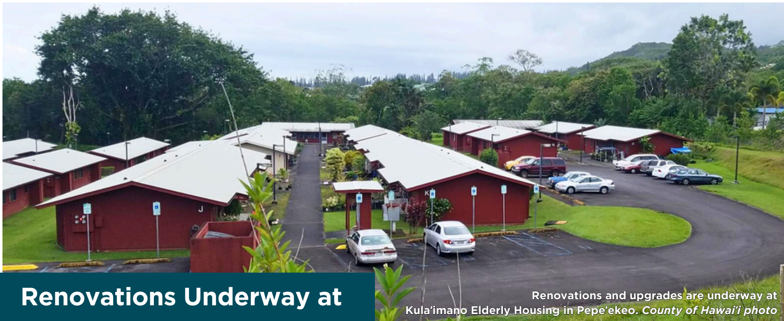
Renovations and upgrades are underway at Kula'imano Elderly Housing in Pepe'ekeo.