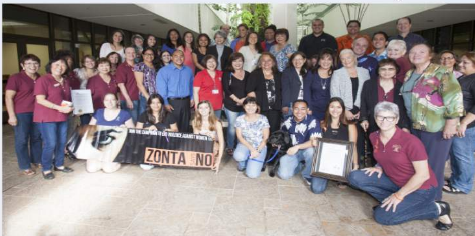
Certificate of commendation presented April 22 to the Zonta Club of Hilo.

If the jeans don't fit, you must acquit, the Italian Supreme Court ruled in 1999 when it overturned a rape conviction, and inadvertently inspired Denim Day, a rape prevention education campaign that raises community awareness about