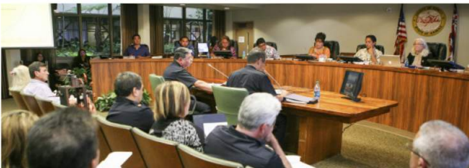
The Police Department is one of the 20 county departments and agencies that the Hawai'i County Council reviewed in the April budget hearings.