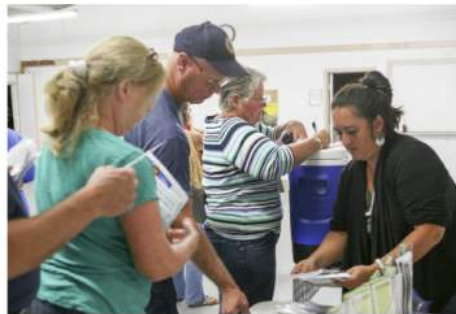
A free community workshop on rainwater catchment was held in Ainaloa

As part of this yearlong effort, UH Sea Grant and its partners is holding nine free informational workshops across the island for residents to learn more about rainwater catchment operations, and maintenance and best practices to improve safety.