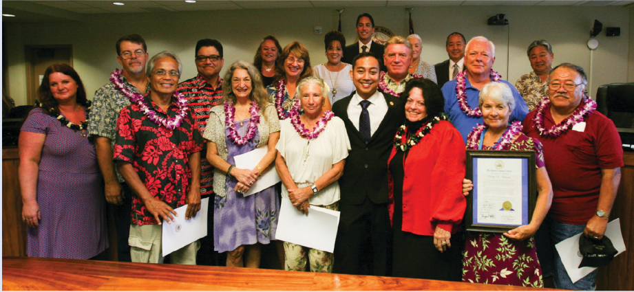
Puna Neighborhood Watch coordinators are honored by the County Council.