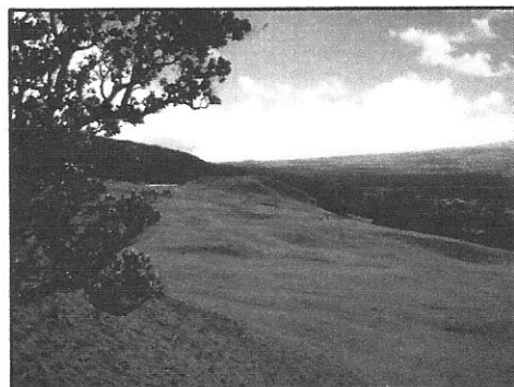
View from the pu'u above Waimea Town

It is on the basis of this constitutional "Public Trust" provision that decisions involving land and water must be guided by the "Precautionary Principle" when we weigh our private wants against the ability of the environment to accommodate those wants. The precautionary principle requires long-term vision and mandates that government entities favor caution and conservation in any case in which information is uncertain. The burden of proving that the resource is adequate and that its proposed use is consistent with the sustainable health of the ecosystem falls on the party proposing to use the resource.