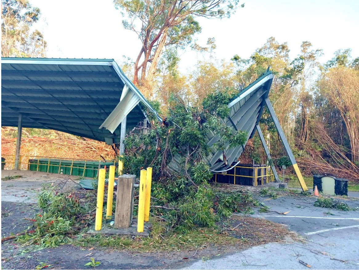
Glenwood Transfer Station