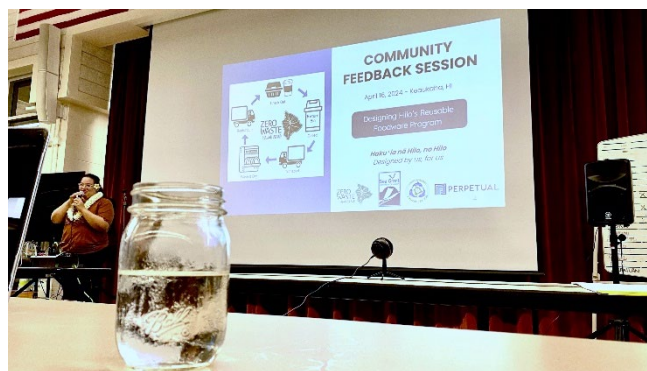
Hilo Reusable Foodware System Workshop – April 16, 2024